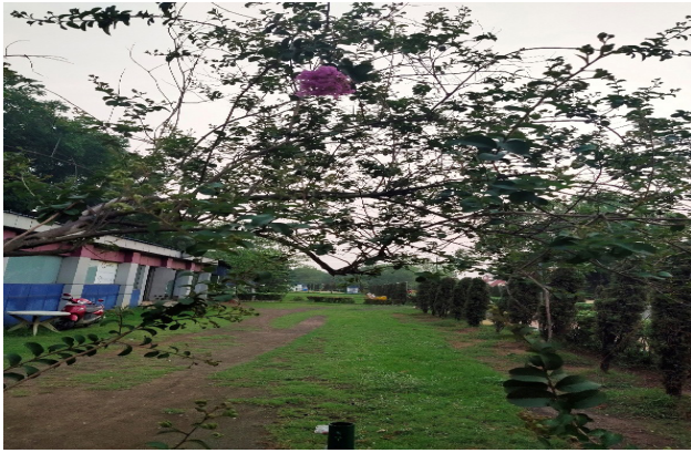
Fig. 3: Domesticated trees in row