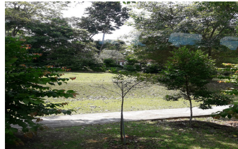
Fig. 5 (b): Domesticated vegetation acts as secure adobe to fauna