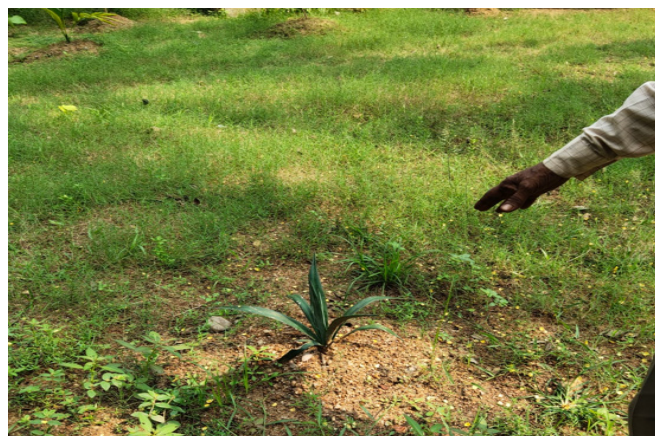
Fig. 2: Raising saplings domestically