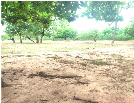
Fig. 4 (b): Practices of raising domesticated vegetation on vacant land