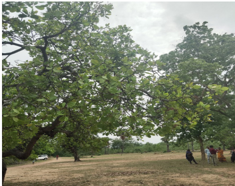
Fig. 4 (a): Practices of raising domesticated vegetation on vacant land