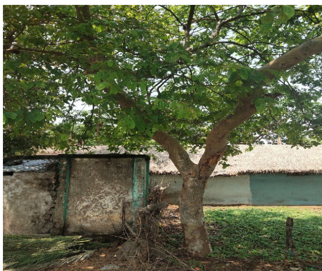
Fig. 1: Domesticated tree at home