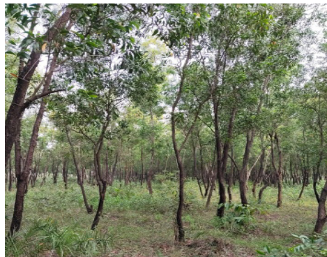
Fig. 4 (c): Practices of raising domesticated vegetation on vacant land